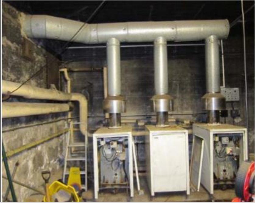
Above: Before renovations; Below: After renovations